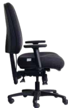
high back & ergo seat BB5-3S4-X6J