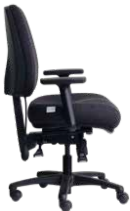
mid back & small ergo seat CC5-3S4-X6J

Castor options include pressure lock, pressure release and PU castors for hard floors.