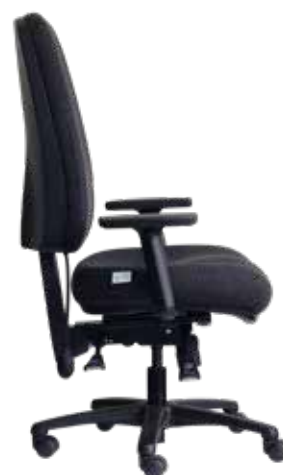
extra high back & xl seat AA5-3S4-X6J