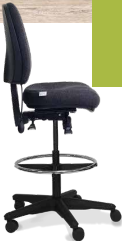
drafting mid back & small ergo seat CC6-3X7-X7B