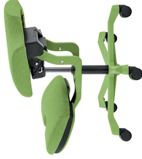
“Low & Kneeling”