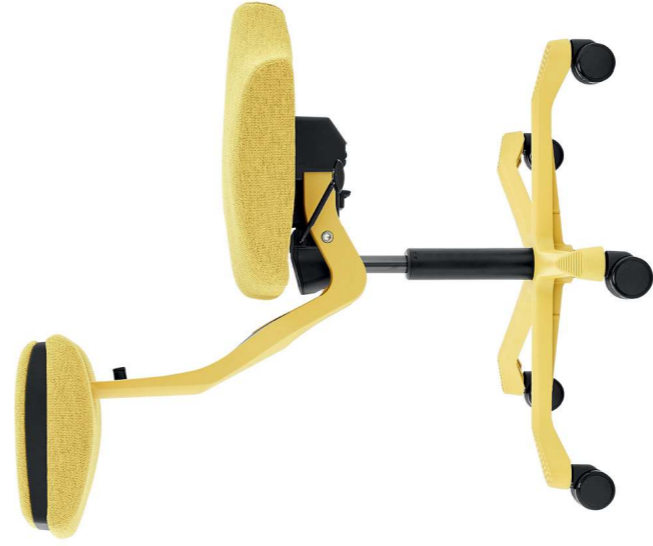
“Flip & Meeting”