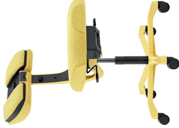
“Flip & Reading”